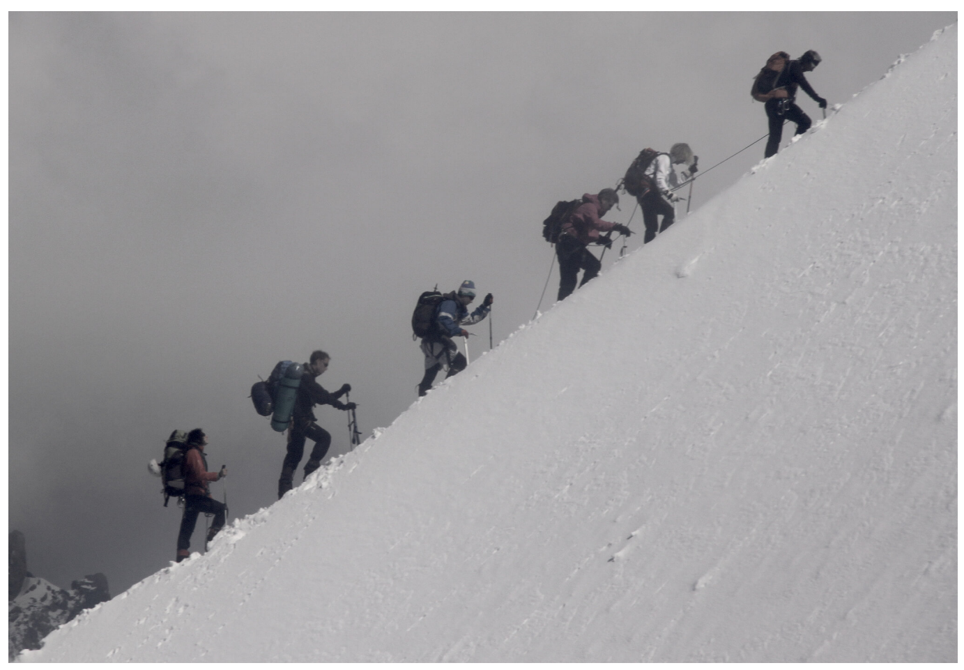
Iddaa sonuclar canl iddaa mac sonuclar